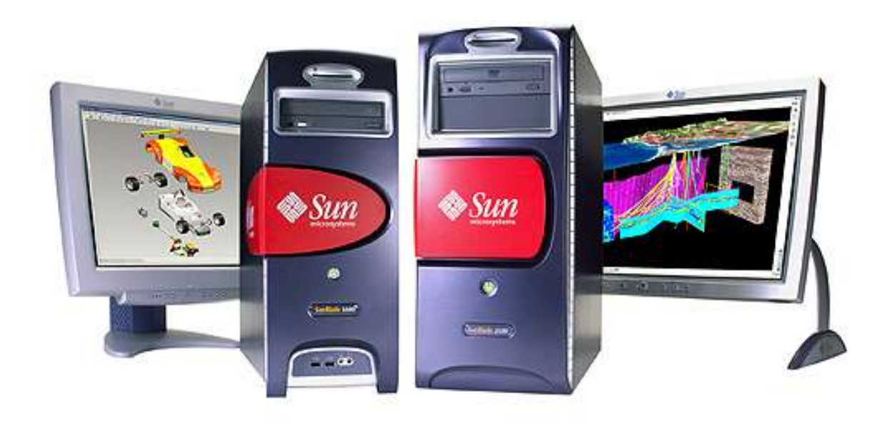
Figure 1: Sun Blade 1500 and Sun Blade 2500 Workstations