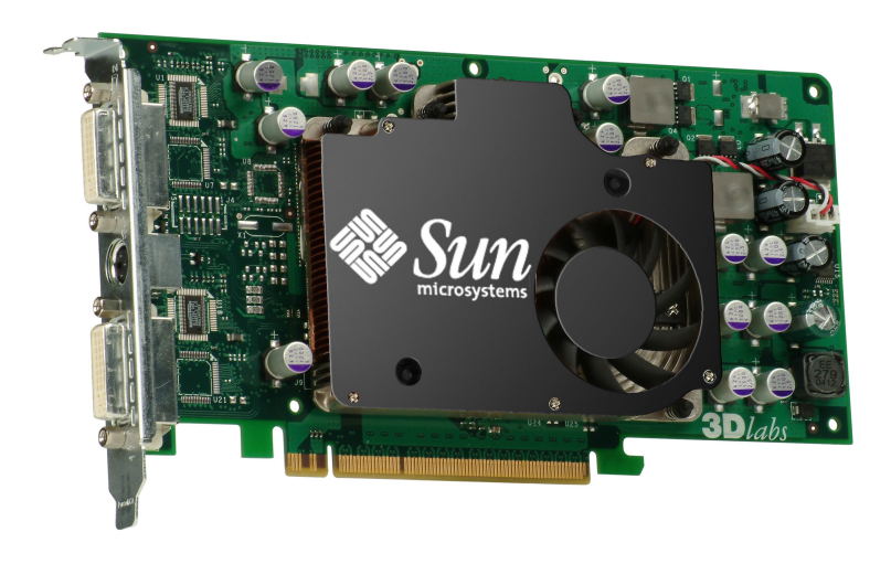
Figure 3. Sun XVR-2500 graphics accelerator

The key specifications and features of the Sun XVR-2500 graphics accelerator are listed in the table below.