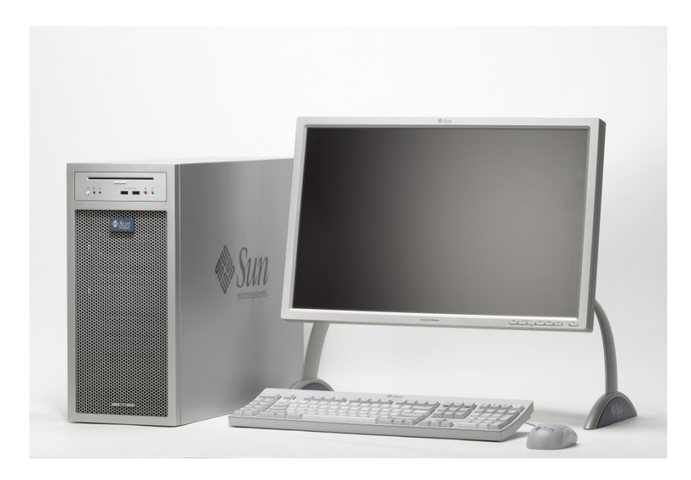
Figure 1. Sun Ultra<sup>™</sup> 25 workstation