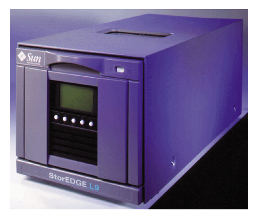
Figure 1. Sun StorEdge™ L9 autoloader