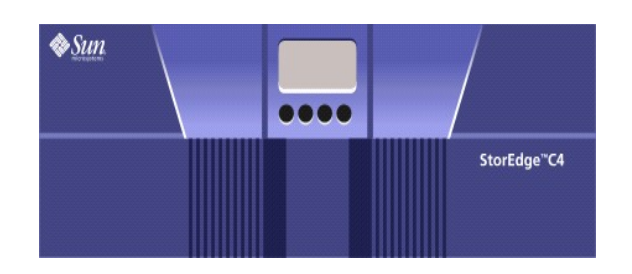
Figure 1. The Sun C4 tape library